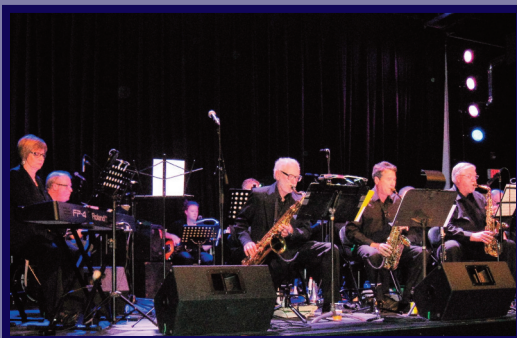
40th Anniversary Executive Orchestra (Park Theatre)