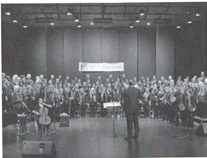
Spirit's Call Choir, December 2012