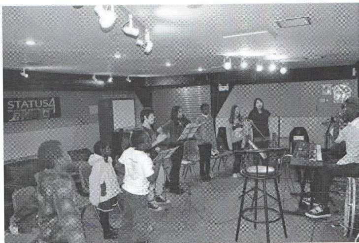
Status4 Singers rehearsing, May 2013