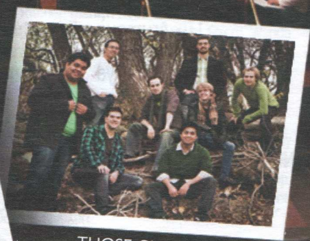
THOSE GUYS Musical Guest